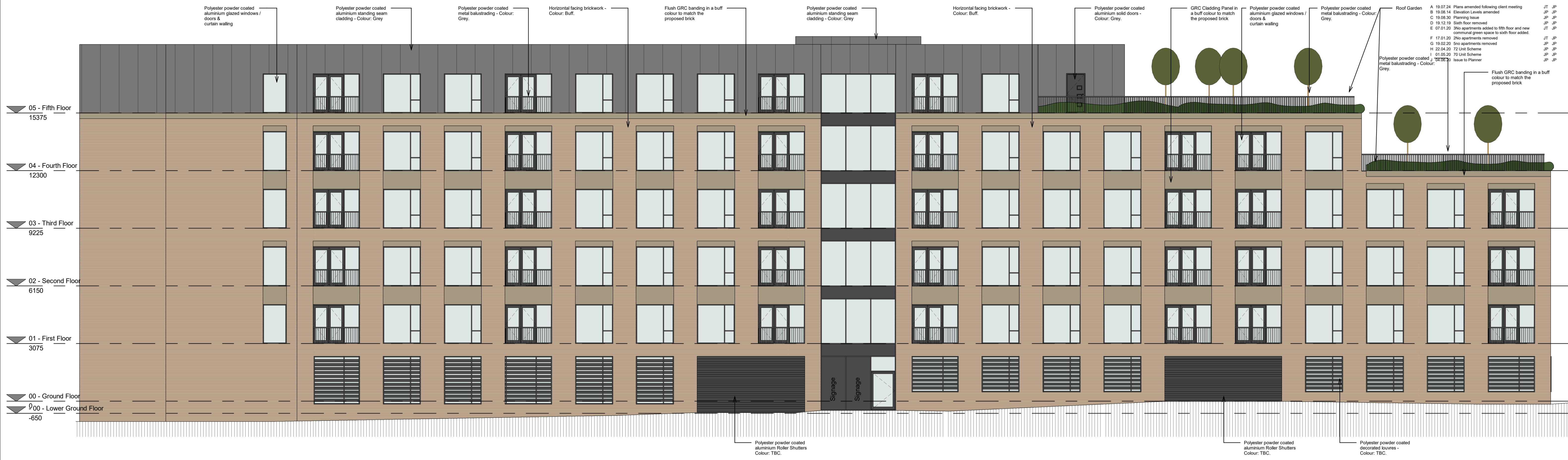
West Elevation 1:100@A1