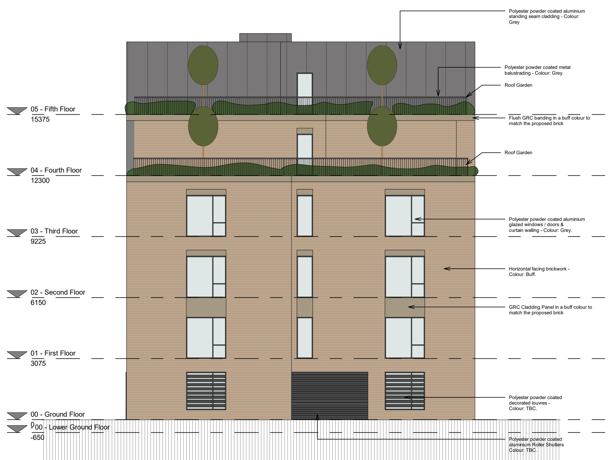
South Elevation 1:100@A1